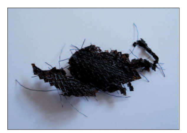
FIGURE 3: Pieces of stent removed at esophagoscopy.

ported as squamous cell carcinoma. Computed tomography showed liver metastasis. A covered, selfexpandable metallic 12 cm Ultraflex esophageal stent (Boston Scientific, Natick, MA, USA) was used in patient treatment; no complications due to stent placement occurred (Figure 1). Eight months later, the patient again presented with dysphagia. A posteroanterior chest X-ray revealed what appeared to be a broken distal stent with compression of the tumor (Figure 2a). Three days later, the stent was completely fractured, and a second stent was implanted (Figure 2b). The broken pieces of the stent were removed endoscopically (Figure 3).